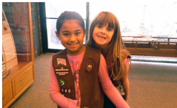
Two brownies had a great time during the scavenger hunt.

Did you know you can schedule a Badge or Journey activity for your Girl Scout group at the Museum? Contact Shirley at sdelatorre@nssm.org for details!