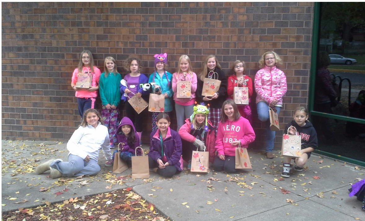
The Shakopee Service Unit shows off all of the stuff they made at Camp North Star.

We have our 2015 overnight dates posted on our website at nssm.org . Do not let another group take your date—get on the schedule right away!