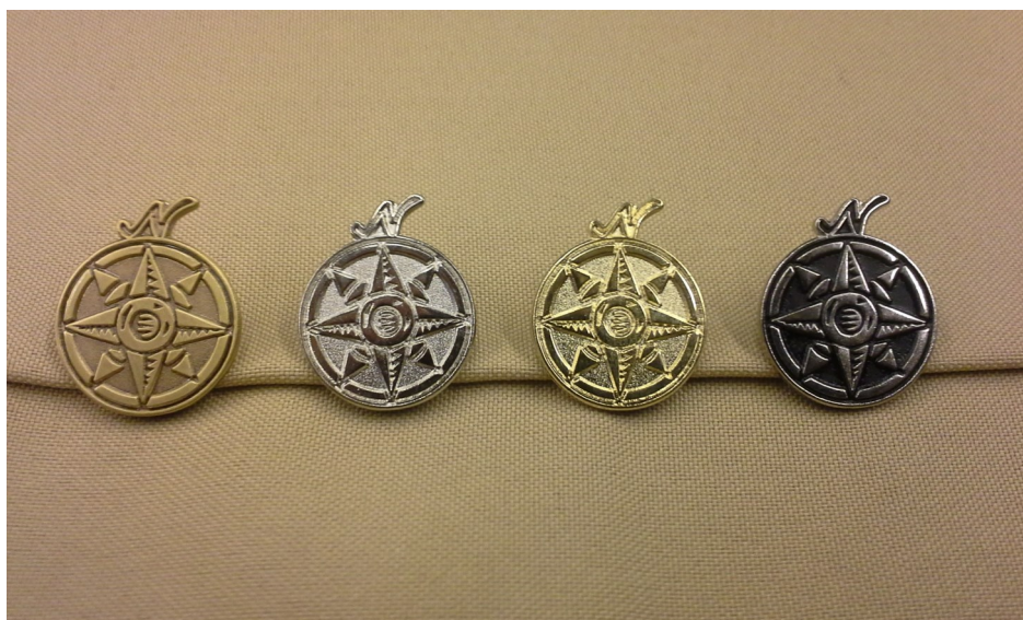
In this photo are pictured the North Star Museum compass pins that are available to members at the bronze, silver, gold, and platinum levels.

Who better to tell our story than our members? You are the champions of the North Star Museum and we invite you to shout it to the world. As we like to say at the Museum, "Values Kept Here." And, among those things we value most, is you. Thank you, for being a member of the North Star Museum!