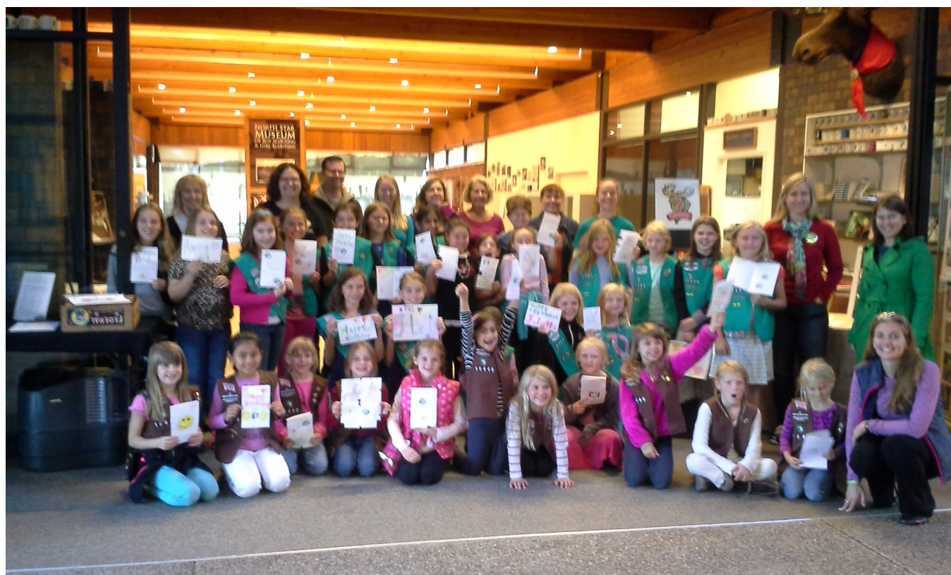
What a crowd. The Eden Prairie Service Unit enjoyed a great day at the Museum.