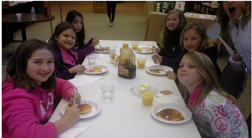
There is nothing like breakfast at Camp North Star.

Sprinkled amongst the journey requirements were the Museum’s most popular overnight activities, like songs around the fire, s’mores, and watching “The Golden Eaglet.” Sunday morning, the girls enjoyed a breakfast of pancakes and juice followed by more journey activities. Before the girls departed, all gathered hand-in-hand for the Girl Scout Friendship Circle. The leaders were amazed at the wonderful time they all had and the girls were happily skipping about, not wanting to leave. Another successful overnight adventure!