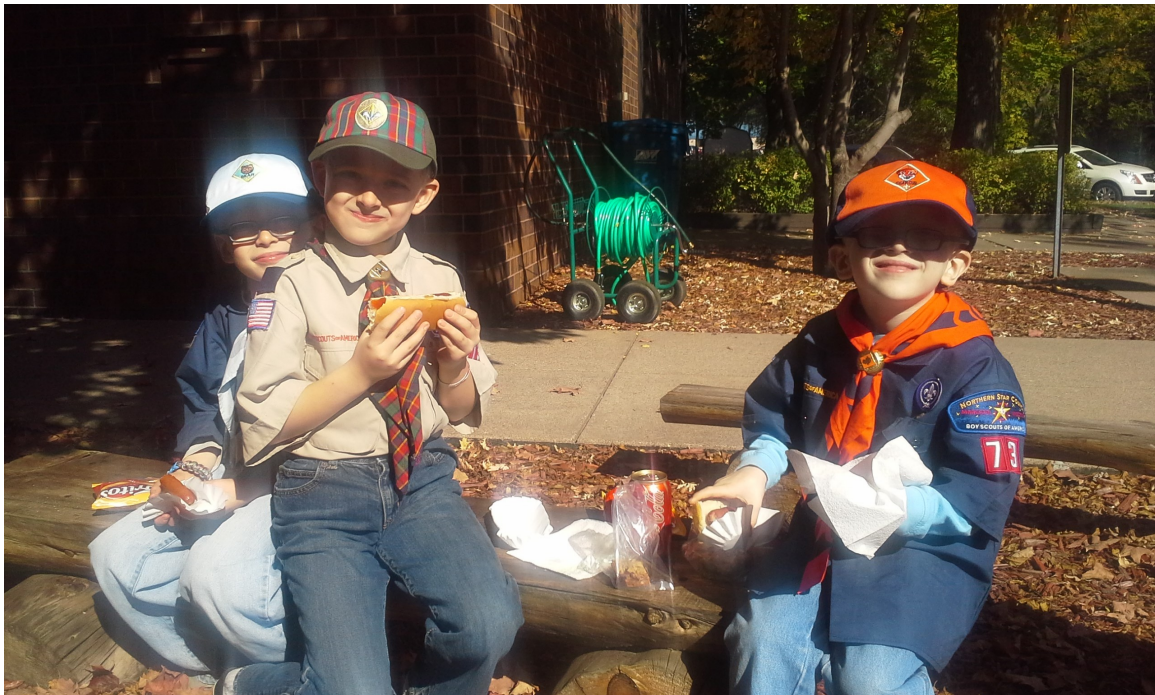
Some Cub Scouts enjoy hot dogs and sunshine at the Museum's Open House.

of fellowship, fundraising, and fun. Please support the Museum on Give to the MAX Day, November 13, 2014.