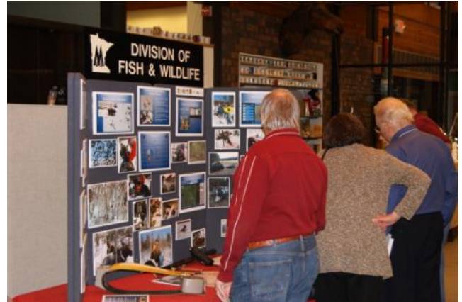
Both the kids and the adults showed plenty of interest in the DNR exhibit at the Open House.