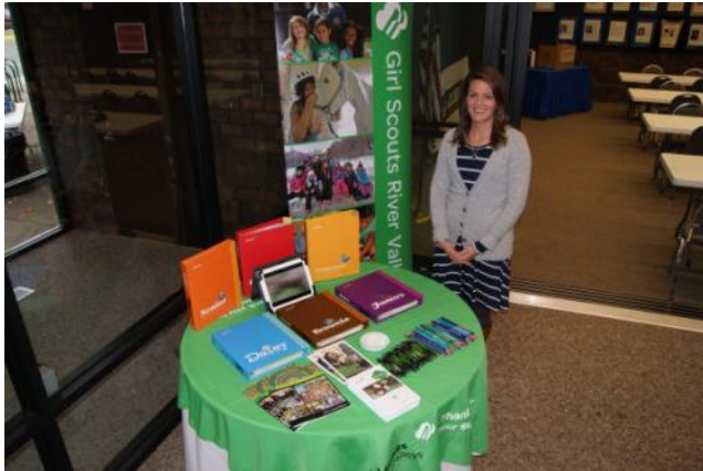
There was plenty to do at the Open House, including a Girl Scout display (left) and, of course, FOOD, like the s'mores being prepared by these Scouts (right).