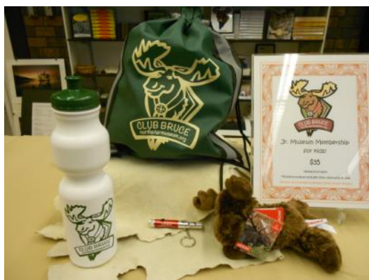
The Club Bruce Adventure Pack

Look for other Club Bruce program elements in the months ahead. We are planning a patch, special programs, and a regular Bruce the Moose comic strip that runs in a local publication. We expect that Club Bruce will raise the profile of the Museum among youth, increase membership, and increase Museum visitation. Spread the word!