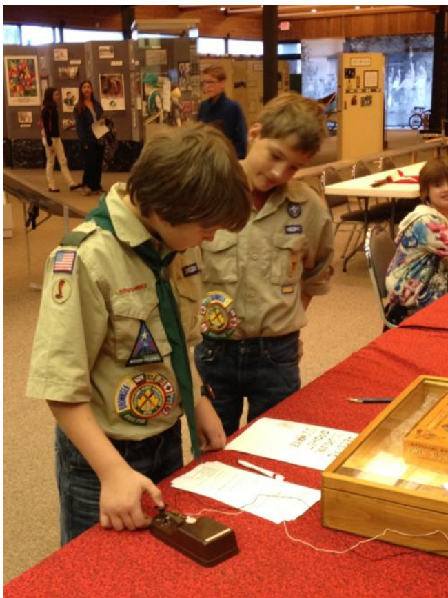
Scouts practiced Morse code during JOTA.