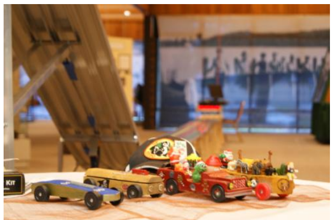
Current and historic cars are lined up and ready to race.