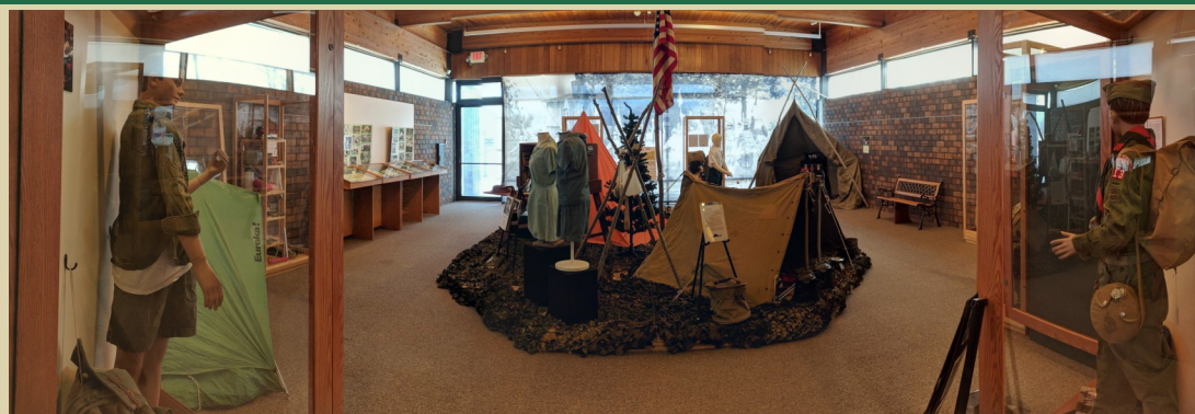
Panoramic photo of the Museum's new camping exhibit.