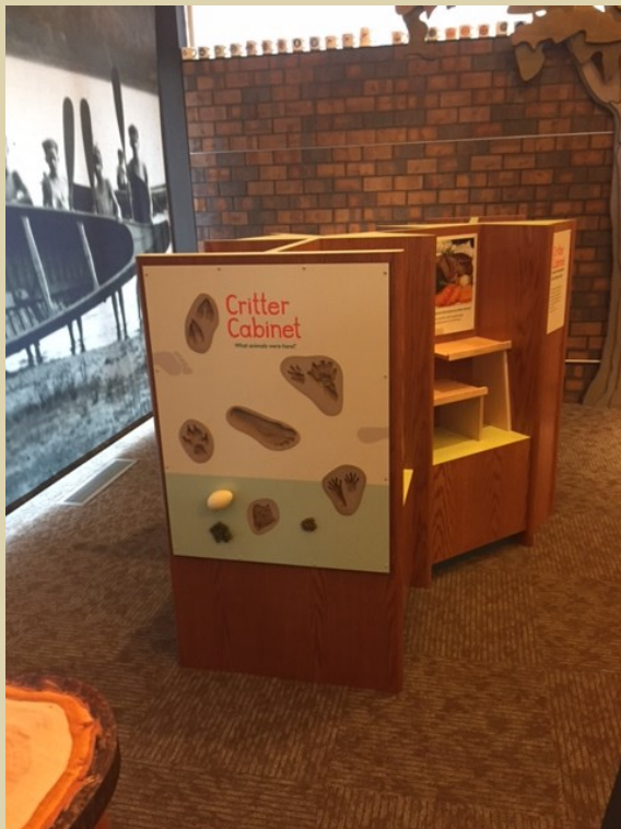
Pictured above is one of the three new additions to the Adventures in Campcraft exhibit: the “Critter Cabinet.”

need to plan a trip to the Museum today.