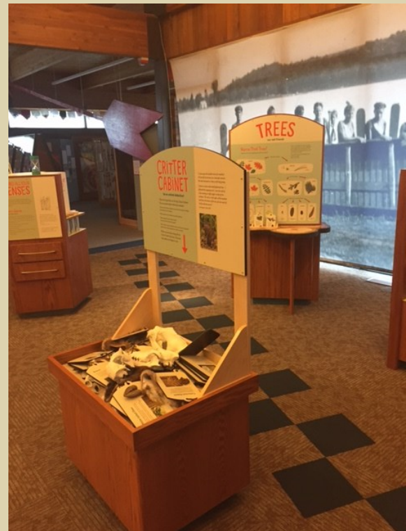
The Adventures in Campcraft exhibit now includes the “Critter Cabinet” and a tree identification station.