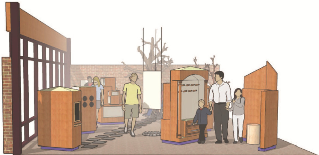
Hands-On History gallery exhibit plan

You may recall that, through Crowdtilt, the Museum raised $7,500 in 2013 for use by the consulting firm Museology to conceptualize a design for a hands-on history space at the Museum. The whole idea is to provide a fresh approach to Scout history in order to capture the imagination of our youngest visitors. Every youngster wants to hold, touch, and get involved--you know, the thing that gives archivists gray hair. Now, thanks to a $90,000 three-year grant from the Katherine B. Andersen Fund of The Saint Paul Foundation, hands on history will soon be a reality.