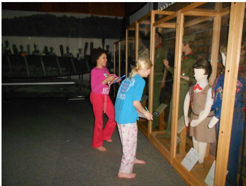
There is nothing like a hunt through history--in the dark!

First Aid Badge, Girl Scout Way, and now Night Owl!