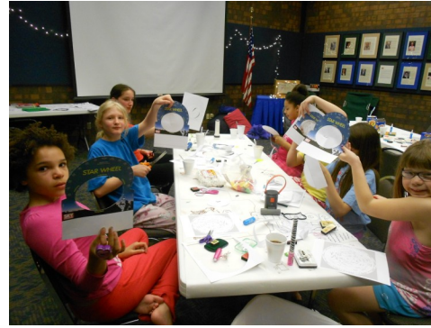
The girls of Cadette Troop 15354 work on their star wheels.

If you'd like to have a customized overnight adventure at the North Star Museum for YOUR unit or troop, contact Shirley De la Torre at sdela-torre@nssm.org . We have one remaining opening in December and we can put you on the list for next year's dates.