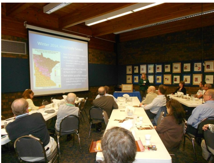
A large and diverse crowd enjoyed the DNR presentation at the May 12 Pause That Refreshes.