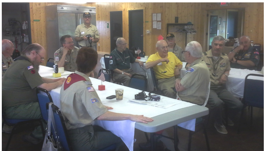
The Skunks in attendance enjoyed some fellowship before the program began.