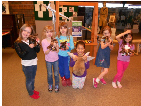
Here are the Daisies of Troop 16440 with their Bruce the Moose paraphernalia.

Our overnight on May 3-4 saw a group of bright and happy Daisies from Troop #16440. The girls enjoyed all the activities that the Museum had to offer: crafts and decorating their stash bags, a history scavenger hunt in the gallery, a Juliette