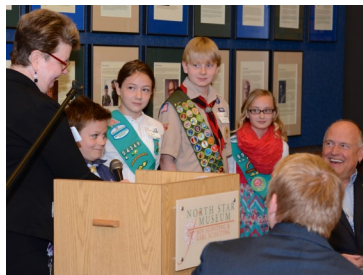
The young and the less young all enjoyed the 2015 Call to History.