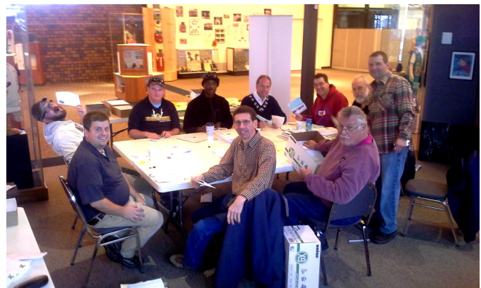
Members of the Many Point Alumni Association work on their project at the Museum.