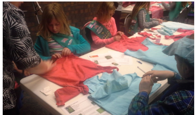
Girl Scouts are totally focused on their projects at The Science of Style Workshop hosted by the Museum on January 30, 2016.