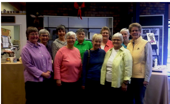
Pictured above are the Girl Scouts from Troop 192 enjoying their celebration at the Museum.

Visit our website at www.nssm.org and click on membership. Look for the flyer and application for Alumni/Alumnae Membership . North Star Museum welcomes you with open arms, ready to celebrate YOU and your fellow Scouters. North Star Museum – Celebrating 40 Years of Preserving Your Scout Memories