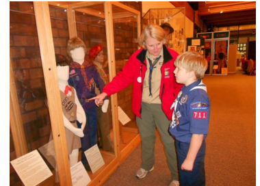
Passing knowledge from one generation to the next

“A Call to History” will provide a great opportunity those unfamiliar with the Museum to learn