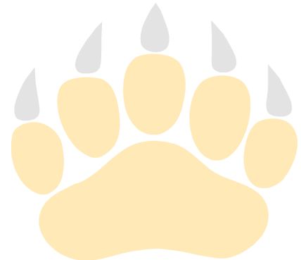
Kodiak Leadership Challenge logo