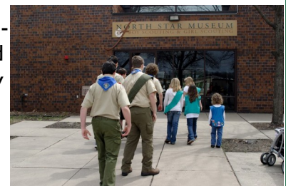
Come visit the Museum