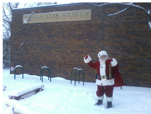
Santa (Chuck Clausen) Claus says: "This year, shop at the North Star Museum for your holiday gifts."

Every youngster loves Bruce the Moose (some adults too) and this plush comes with moose habitat info and educational details. Only $8.00