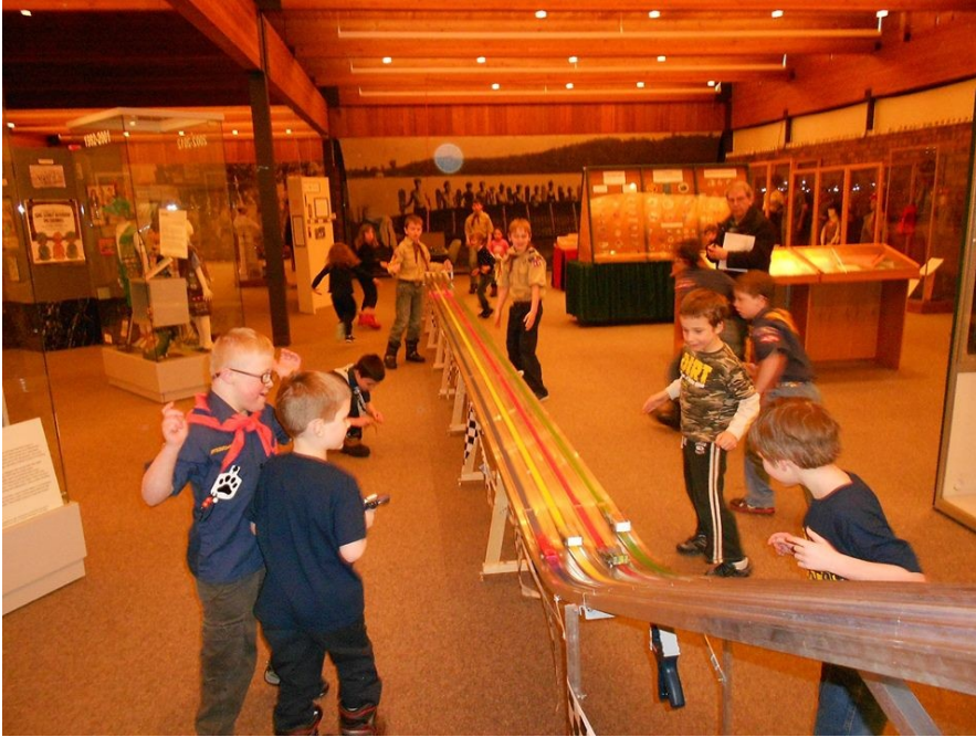
This group of Cub Scouts is having a blast racing their cars on the Museum's track.

As 2015 begins, so begins Pinewood Derby season. Did you know that the Museum has a state-of-the-art Pinewood Derby track? The implications are significant. If your unit does not have a track, or is looking for a better track, a unit may schedule its Pinewood Derby at