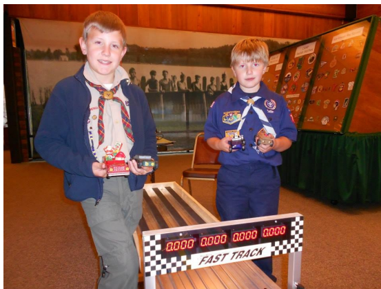
Two Cub Scouts at the finish line.

The Museum's Pinewood Derby track is not just for boys. Plenty of Girl Scout groups have enjoyed racing at the Museum. Several Pinewood Derby races have already been booked for 2015. Do not wait. Call the Museum to book a Derby or a practice session today!