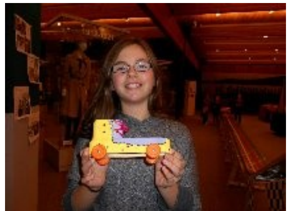
A young lady shows off her Pinewood Derby car.