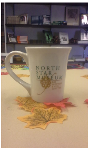
The new Museum mug is flying off the shelves this holiday season. Get one today for your favorite Boy Scout or Girl Scout history buff!

Featuring a large size, handsome logo, and microwave-ability, it is a great mug for your coffee, hot chocolate, or tea! Just $8.00