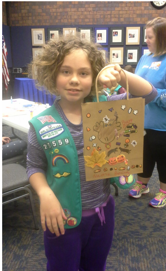
A proud Girl Scout shows off her creation at a recent Overnight at the Museum.

Overnight at the Museum is a wonderful event for Girl Scouts as well as Cub Scouts and younger Boy Scouts. There is even the option to roll in a Girl Scout Journey or a Merit Badge. Other organizations may offer overnights too, but ours is half the price and it's tailored to your Scouting needs! So sign up your Troop, Pack, or Service Unit for an Overnight at the Museum Camp-in Adventure! A fantastic time at a great price is guaranteed. Sign up today before all of the dates are taken.