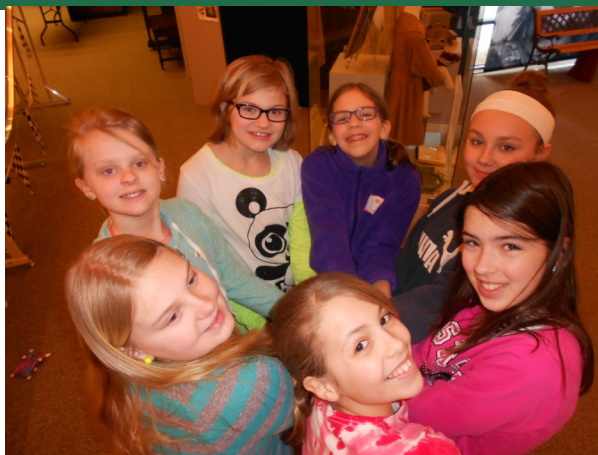
The Juniors of Troop 54153 enjoy Camp North Star.

As this issue of the Museum News went to press, only the following dates are open: July 19/20; Nov. 15/16; and, Dec. 6/7. The fun begins at 7:00 pm Saturday night and ends at 10:00 a.m. Sunday morning. The cost is $35 per person, the minimum group size is ten and the maximum group size is