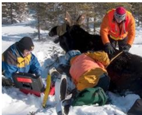
DNR Moose Research Team

Why do we call it a walk on the wild side? The Museum will be welcoming as presenters members of the Minnesota Department of Natural Resources Moose Research Team . This team of scientists is striving to save our Minnesota moose population. Come hear their amazing stories of high adventure and commitment to saving the Minnesota moose as they share their latest data and hopes for the future of wildlife in Minnesota.