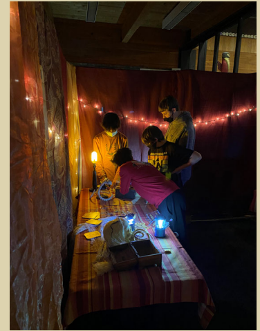
Scouts enjoying the legendary Escape Room.