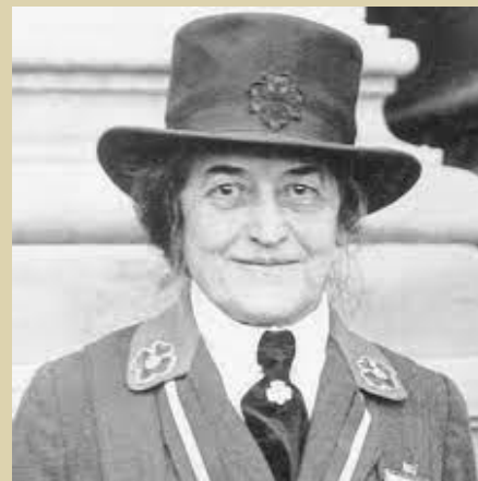
Juliette Gordon Low.

Don't miss out on the glow-tastic festivities! The cost is only $15 per person and the price of admission includes a birthday treat. Register as an individual or as a troop online at https://nssm.regfox.com/2023-igl . See you at the Glow Party!