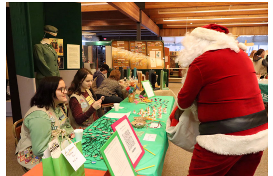
Santa visited the Boutique at the Museum during the 2022 Holiday Hop.

events for the girls in the participating troop.