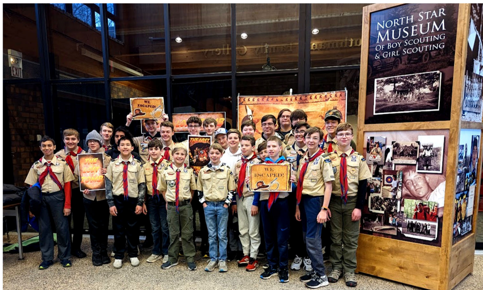
Troop 5 is pictured above during its campout at the Museum on April 29-30.