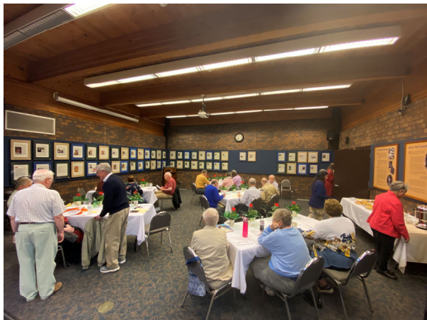
The Founders Hall was filled with Museum members at the annual meeting

On May 18, 2023, the Museum held its annual meeting for members. The annual meeting also gave the thirty or so members in attendance their first opportunity to see the “pretty much” completed Home Front exhibit.