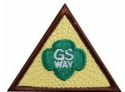
Brownie Way Badge

On January 26, girls will have the opportunity to earn the majority of the badge with only a small part to be completed later with your troop. The cost is only $10 per girl. The price includes a snack. Simply call the Museum (651-748-2880) to register.