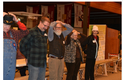
No, there was not any dancing at Derby Night. This is a photo of the heads and tails raffle.