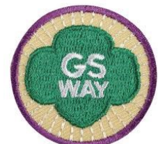
Junior Way Badge