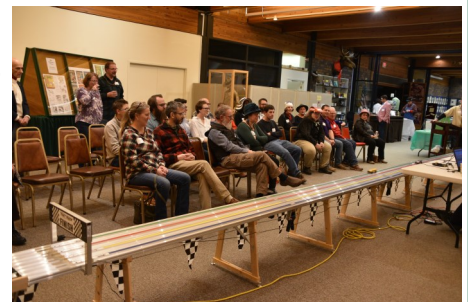
The crowd is on the edge of their seats during a Derby Night heat.