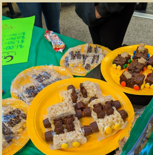
The Girl Scout derby event on November 16 included these derby-themed snacks. These went into the stomach - not onto the track.

with a Girl Scout unit, Pinewood Derby might be a great program for your girls. Call the Museum today to arrange a time.