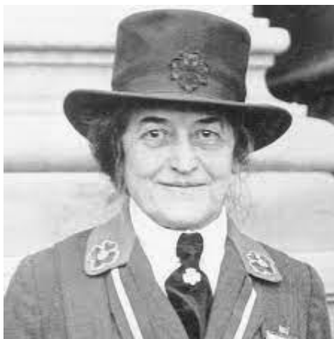
Juliette Gordon Low.