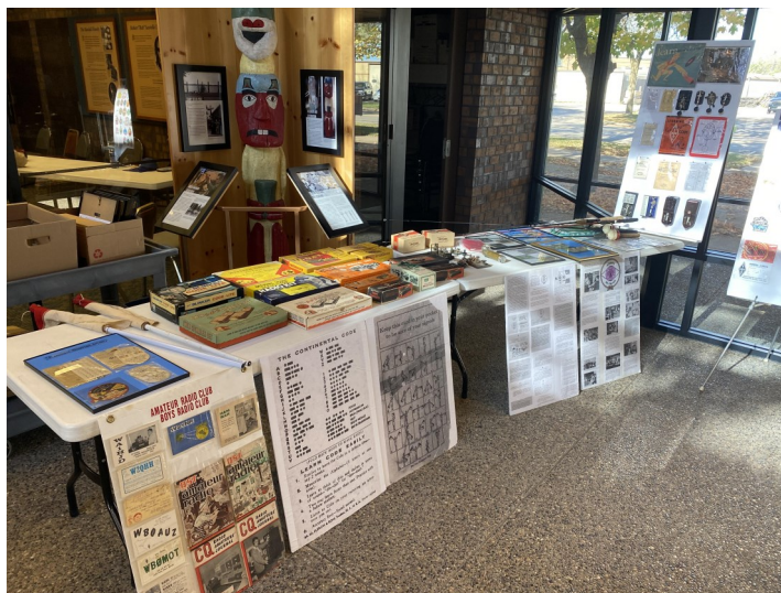
In addition to the opportunity to go on the air, Jamboree on the Air includes some great radio-oriented exhibits.

As for JOTA/JOTI, there is no charge. Scouts of all ages and any gender may participate. Visitors can just show up but if you have a group of five or more, we would appreciate it if you could pre-register so we can plan accordingly. Once registration opens, you will be able to register through the Museum's website at www.NSSM.org . Once on the website, go to Programs and Events, then Jamboree on the Air, and sign up for a session. See you "on the air" at radio station KØBSA on October 21!