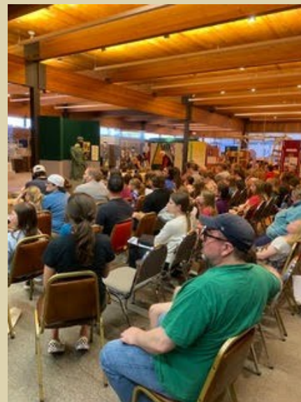
The Roseville Service Unit of Girl Scouts brought quite an entourage to its Pinewood Derby event at the Museum on April 14.