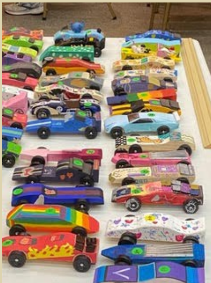
On April 14, the Roseville Girl Scout Service Unit held a Pinewood Derby event at the Museum. A total of 45 cars entered the race. Look at these great designs!