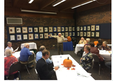
Everyone enjoyed the Museum Trivia Contest at the 2018 Annual Meeting.

We expect to have the television working when the game begins at noon. If you cannot make it then, come over at halftime. We will conduct a brief business meeting at about 2:00 p.m. At that time, we will also show our appreciation to all Museum volunteers. Then, its back to the game and more fellowship. So, if you are a Museum member, a volunteer, or both, this is YOUR day. Even if you