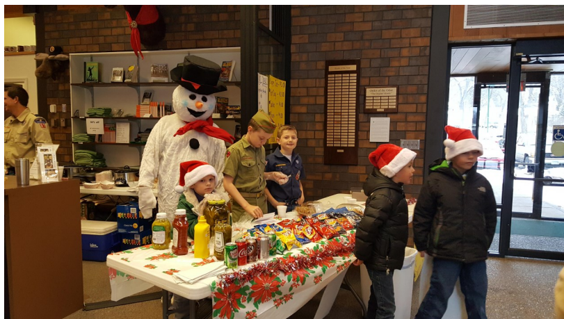
The Holiday Hop was a big hit at the Museum on December 1. Pictured here are the boys of Pack 37. As the official food vendor, they made sure that no one at the event went hungry.