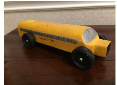
No, this is not a real school bus. It is a Pinewood Derby car that ran in last year’s Derby Night at the Museum. The car’s owner did not win, but he sure had fun.