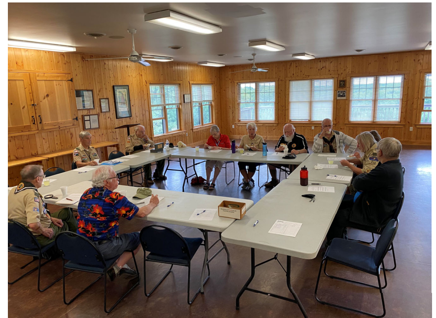
The Veteran Scouter (Skunks) Reunion resumed in August at Fred C. Andersen Scout Camp. However, it morphed into a meeting that focused on the future of the Museum.