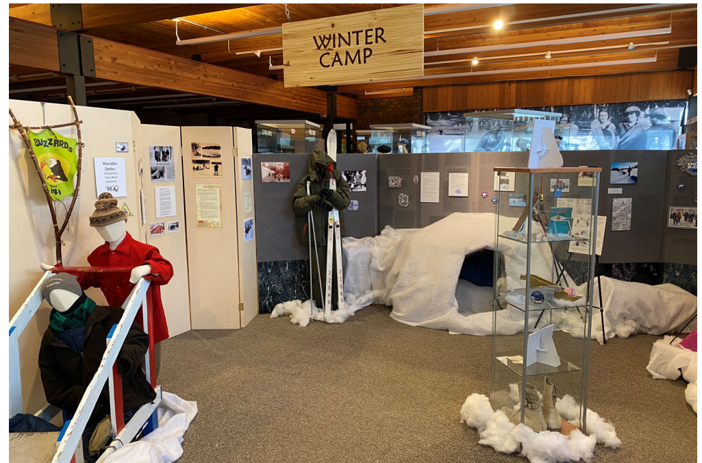
One of the highlights of any recent visit to the Museum is the excellent and realistic camping exhibit. The Exhibits Committee added a winter camping component to the exhibit, dubbed, "Winter Camping — Challenging Nature".