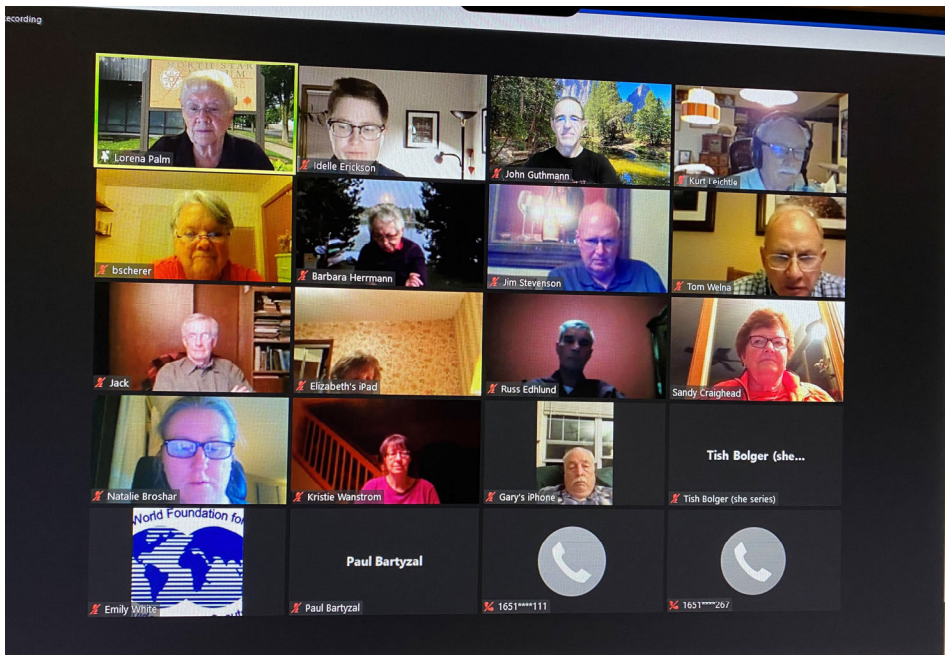
In October, the 2020 Annual Meeting was held via ZOOM.