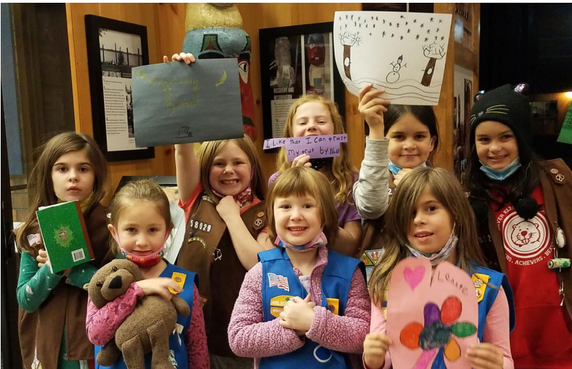
The Museum reopened on February 20, 2021, Saturdays, 10 a.m.-2 p.m. for walk-in visitors. Groups were able to schedule private tours. In December, Daisy/Brownie Troop 58019 from Northern Lights Service Unit visited for a tour and scavenger hunt.

The escape room project (one of several rooms at left) was completed. Because of the new Covid variant, we had to stop before testing it out. We look forward to testing how it will work in the early winter. The public roll-out will occur in January 2022. In other projects, exhibit design and construction slowed but progress has been made and the completion of the Teamwork and Competition exhibit discussing Chariot races, Push Car races and the Klondike Derby is in the final stages of fabrication.