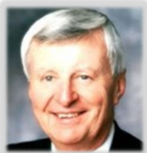
Jim Lee March 2020