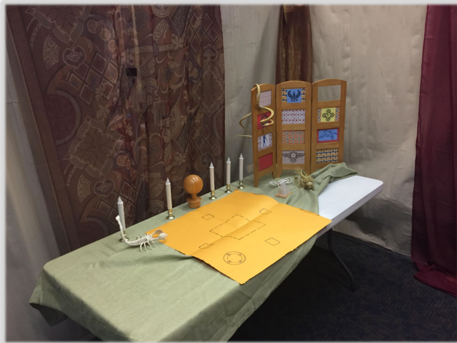
One of several rooms in the maze that makes up the Escape Room.

One of the highlights of any recent visit to the Museum is the excellent and realistic camping exhibit. The Exhibits Committee added a winter camping component to the exhibit, dubbed, Winter Camping — Challenging Nature .