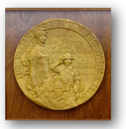
World War I Liberty Bond Sale Medallion

The completion of a Legacy grant project has allowed the Museum to catch up on the processing of the collections as of the end of 2018. The Museum possesses good intellectual control over its collections. Meaning that we have a computer record to tell us we own it, who donated it, a picture, and a box location. We have worked to keep up with the intellectual control by screening objects we take in for consideration. Forms are filled out when the objects come in and then a temporary custody account is opened in the computer program. We are about a month behind in putting material into temporary custody. (If you are interested, we will welcome your help in moving the material forward in the cataloging process. Contact me to find out the volunteer opportunities here.) Collections is logically an ongoing process which is never completed. The collections are key to the purpose of a museum.