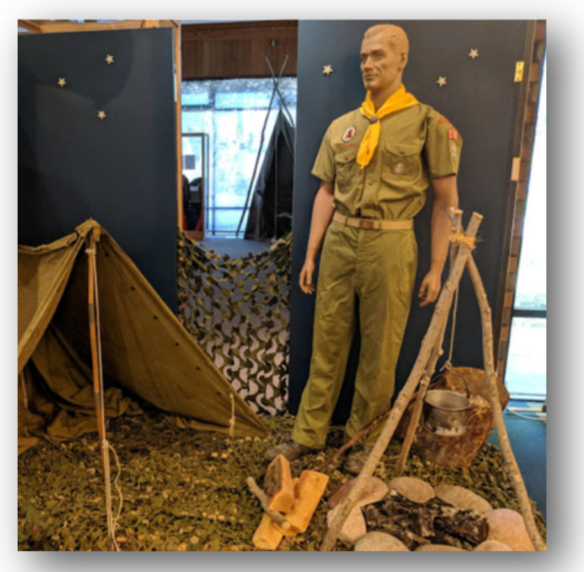
Norman Rockwell Camping Exhibit

The Museum offers a variety of programs such as tours, merit badge classes for Boy Scouts, Journey workshops for Girl Scouts, facilitating special events such as Eagle Courts and Pinewood Derbies. We offer six merit badge events a year which are often filled to capacity. We offered a several events for Girl Scouts such a Juliette Low's Birthday celebration, as well as classes such as the leadership program for Girl Scouts supported by the City of Maplewood. We also do workshops for the Webelos Adventures. Many of the programs are developed in response to requests. Next year we will offer Escape Room programming, watch for the announcement. If you have program needs or want to help please contact the office.