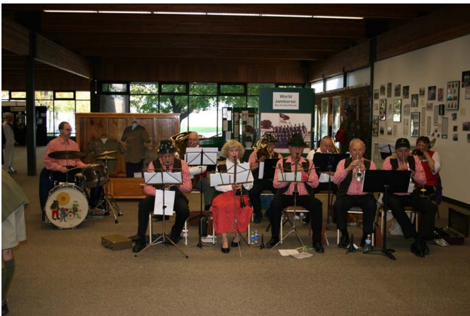
The Lichtensteiner Nine performing during the "Octoberfest" at last year's Annual Meeting.