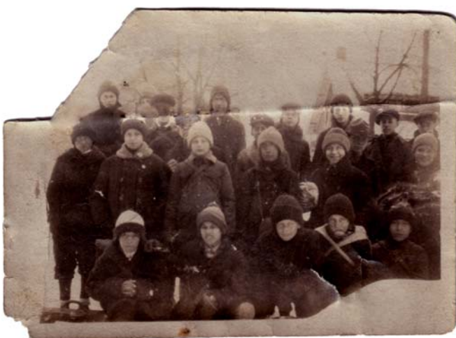
Exciting photo donation