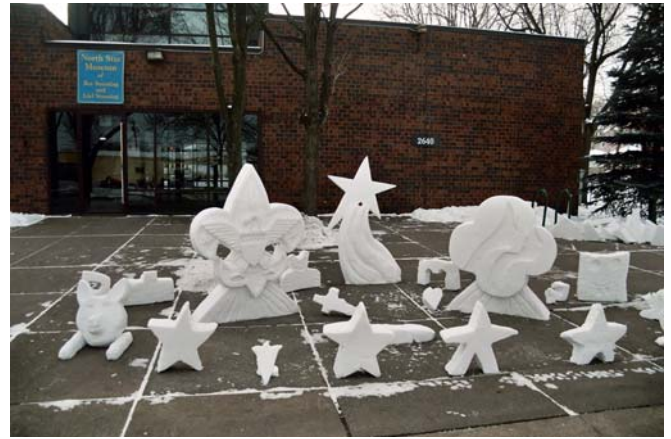
Snow sculptures during North St. Paul's Snow Frolics