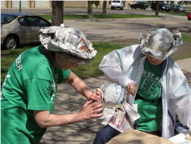
Making hats at Detour Days