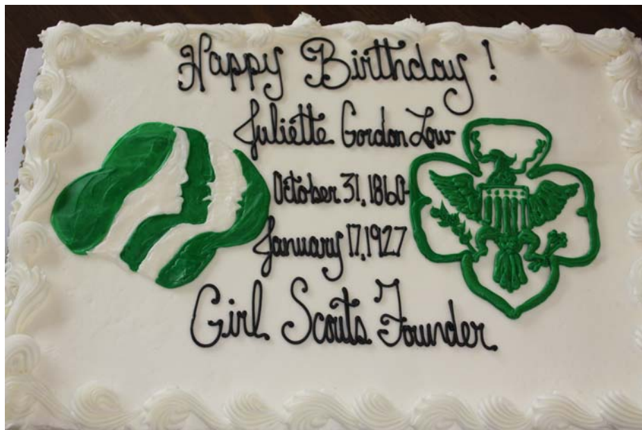
The birthday cake in honor of Juliette Gordon Low before its consumption at the Annual Meeting on October 31