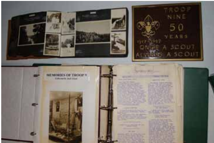
This sampling from the Troop 9 collection consists of a photo album from the 1920's, a memory book, troop newsletters and a sign from the troop's 50th anniversary.