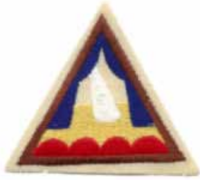
Let's Pretend Try-It