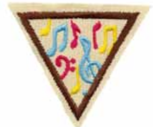
Making Music Try-It