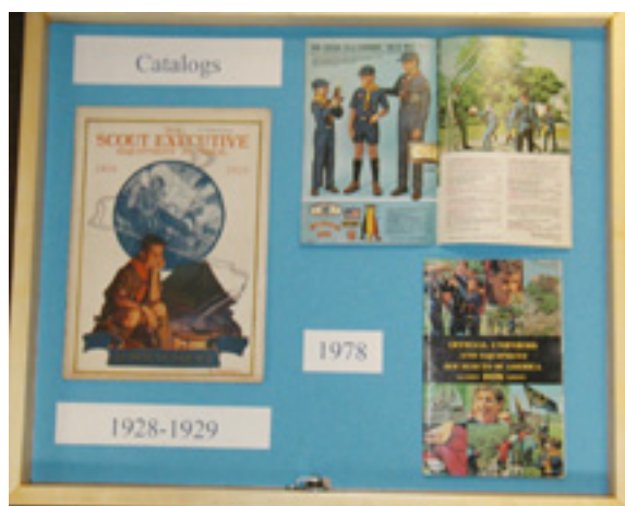
Book and catalog display.