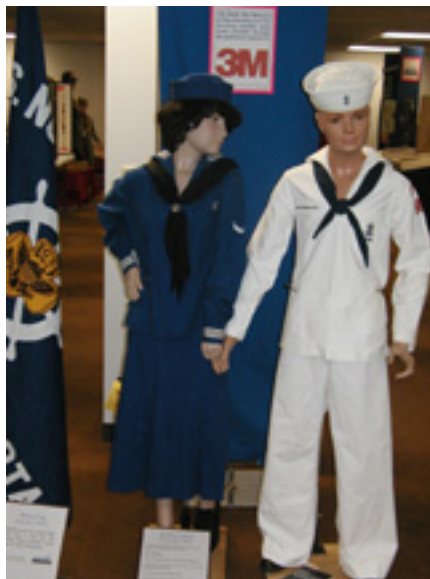
Mariner and Sea Scout mannequins on display in the Museum

We have received over 500 items of memorabilia in just the first 4 months of this year.