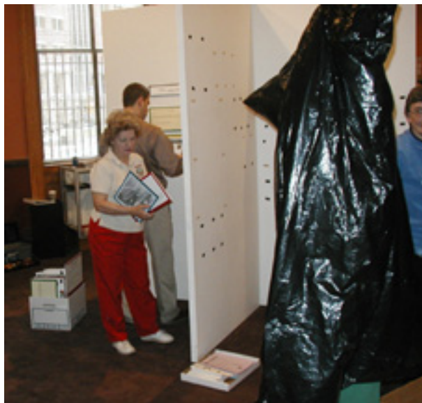
Taking down displays at the Landmark.